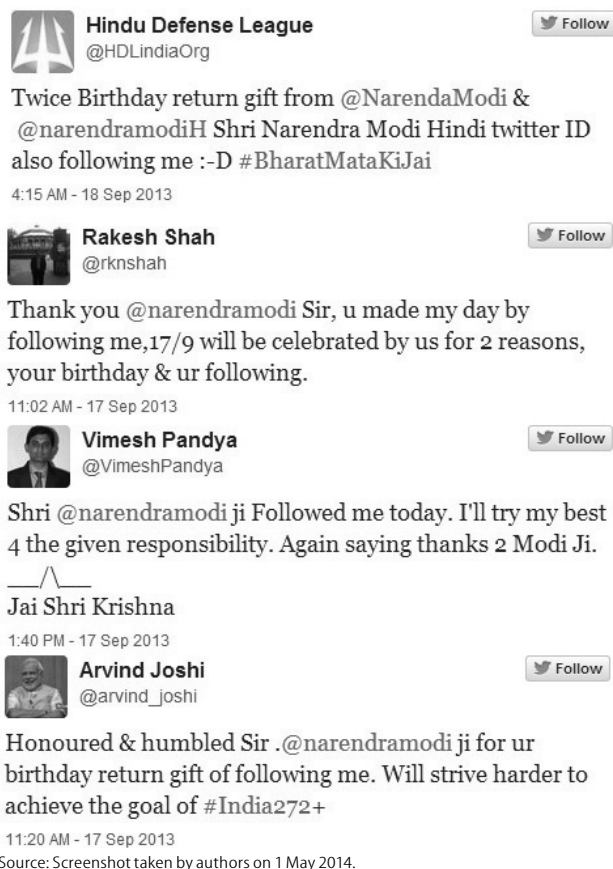
Figure 2: Public Profiles of Twitter Accounts That Mention Modi Following Them

Two categories with low coefficients of variance—youth and development—were consistently tweeted themes in all phases. Political themes such as elections, as well as issues relating to Modi’s own party, the BJP, and the rival Congress Party appear relatively more selectively. Elections are strong in phases 2 and 3, and in the run-up to the general election, rallies, addresses, and political confrontations are very strong. These drop off in phase 4. His home state of Gujarat, a major theme in the first two phases, declines later. The Hinduism theme, represented significantly during the first and second phases, drops off leading up to the elections (Table 4).